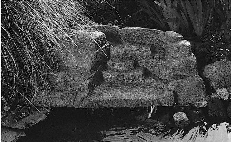
Part # 4600